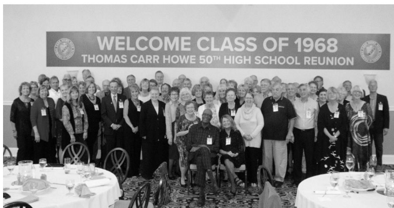
Above: Class of 1968 50 th Class Reunion Group Picture September 29, 2018. They held their reunion dinner at 502 East Event Centre Carmel In. There were over 100 class members in attendance. Right: Howe Reunion Committee September 28, 2018